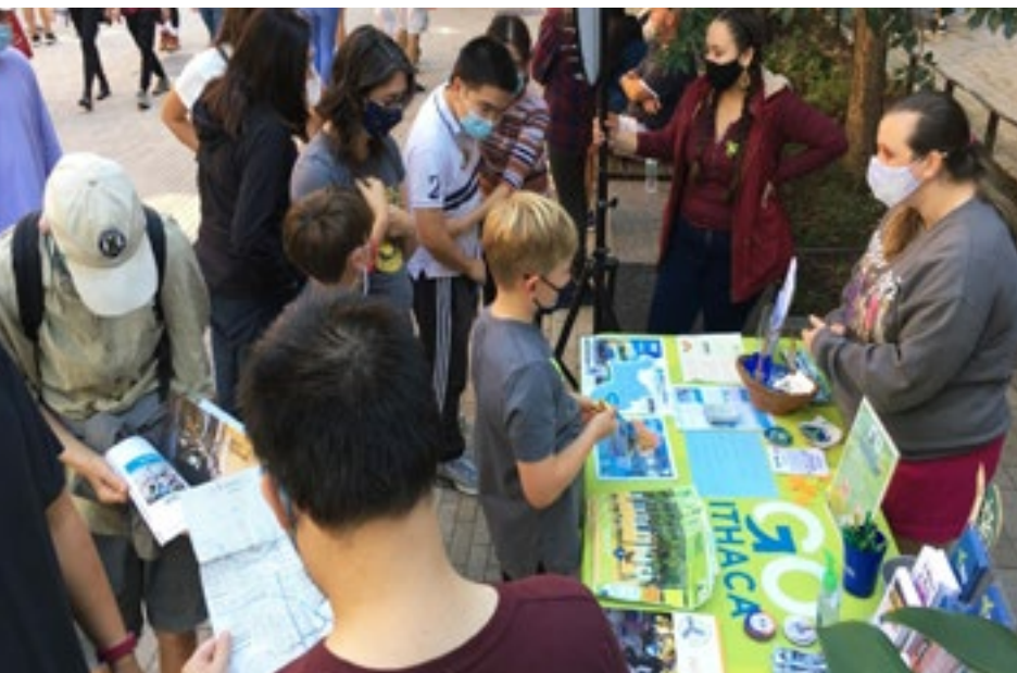
Staff from the Way2Go program answer questions and distribute maps and other local transportation information to visitors at the 2021 Apple Harvest Festival on the Ithaca Commons.