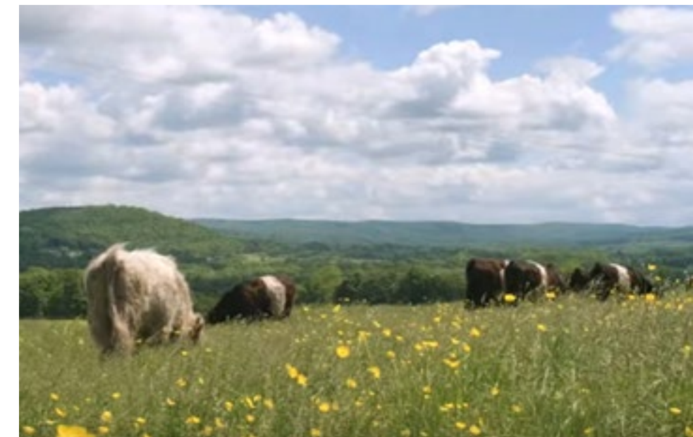
Rotational grazing of Belted Galloway cattle is one of many sustainable practices in use at Grace Wyly Farm in Brooktondale (Photo taken from the farm's YouTube video ).

These efforts emerge from priorities identified in the current Tompkins County Agriculture & Farmland Protection Plan, a document that guides county and local governments in developing agricultural land use policies and projects. Revised most recently in 2015 by CCE-Tompkins staff, the Plan reflects extensive input