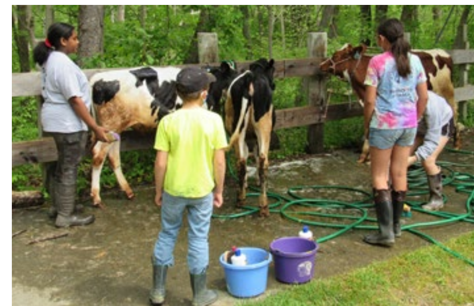
2021 Kritter Kamp participants prepare their dairy calves for show.

Kritter Kamp offers youth a welcoming and supportive entry