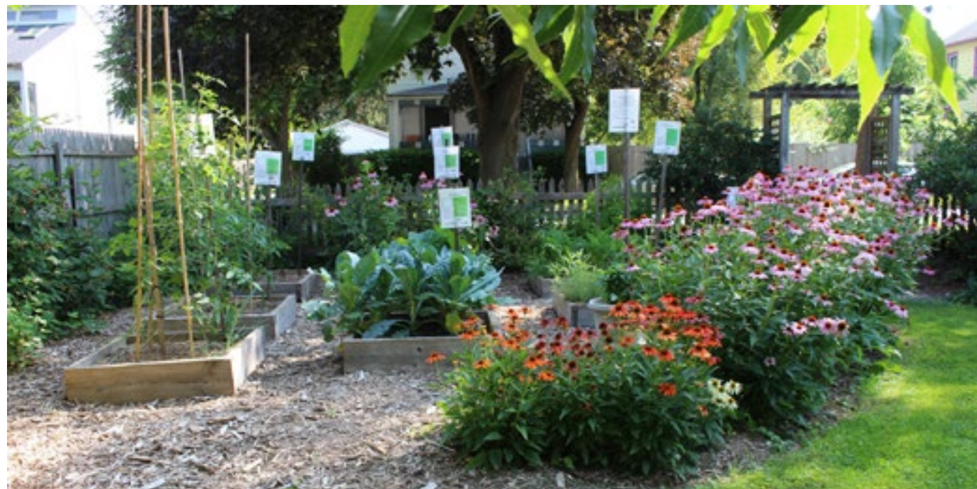
The Master Gardener Demonstration Garden (entrance on Dey Street) as seen in July 2021. Master Gardener volunteers maintain the garden, where they test various new vegetable varieties that are being trialled by Cornell University. Stop by and visit this and the Al Wurster Memorial Rock Garden, both are located behind the CCE Tompkins Education Center in Ithaca.

For more information about this survey or other work to further sustainable farming and conservation practices in Tompkins County, please contact Graham Savio at (607) 272-2292. To consult the Tompkins County Agriculture & Farmland Protection Plan (2015) visit: http://ccetompkins.org/AFPP2015 . Many recommended sustainable agriculture practices are detailed in a series of Fact Sheets compiled by Cornell University researchers Peter Woodbury and Jenifer Wightman in 2018 (available on our website at: http://ccetompkins.org/reducingGHG ). continued on next page