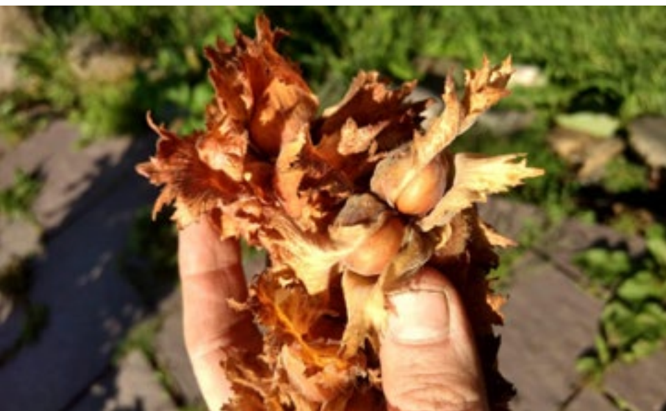
Freshly harvested hazelnuts (Photo: Eric Banford).

taken out of annual production for planting to tree nut crops and assist new farmers in bridging the gap continued on page 29