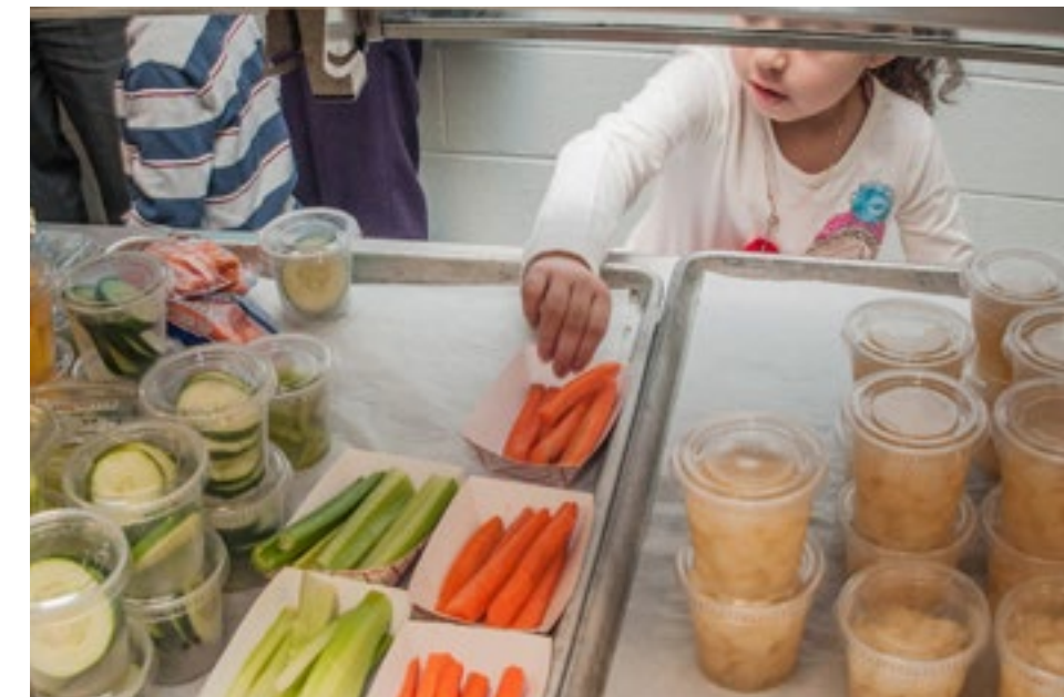
A child chooses carrots from the school lunch line (Photo by Lance Cheung. USDA).

They also developed an infographic for community partners