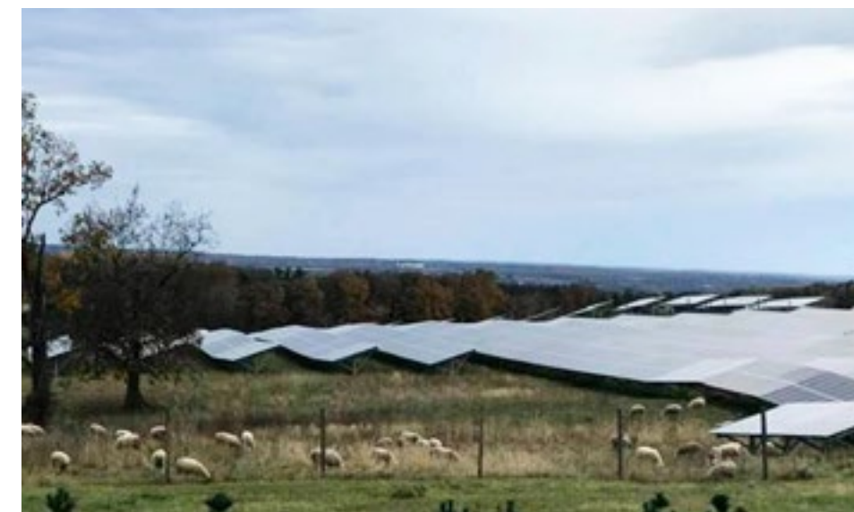
Sheep graze among community solar panels in Dryden, NY.

many Ag educators got involved. Momentum grew through weekly meetings, and a new CCE Ag & Solar list-serve was created that enables CCE educators to connect, ask questions, and share