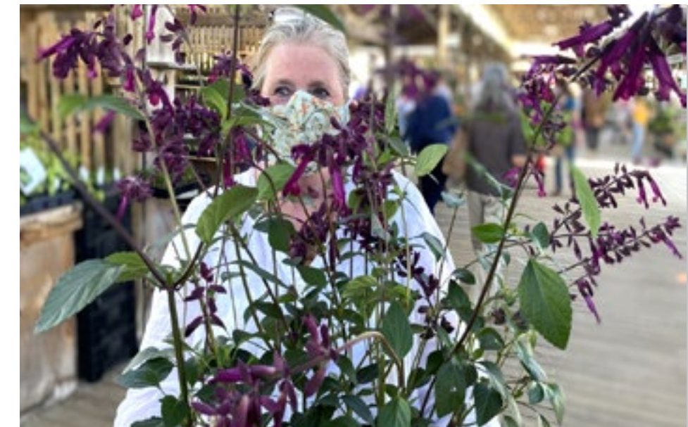
A shopper carries a salvia plant purchased from The Magic Garden at the 2021 Master Gardener Spring Garden Fair & Plant Sale.

Visit http://cctompkins.org/food/snap-ed-new-york for information about SNAP-Ed in Tompkins County and upcoming classes , or contact Sarah Curless, SNAP-Ed Nutrition Educator, at sgc56@cornell.edu or (607) 272-2292 voicemail ext. 252 ☀