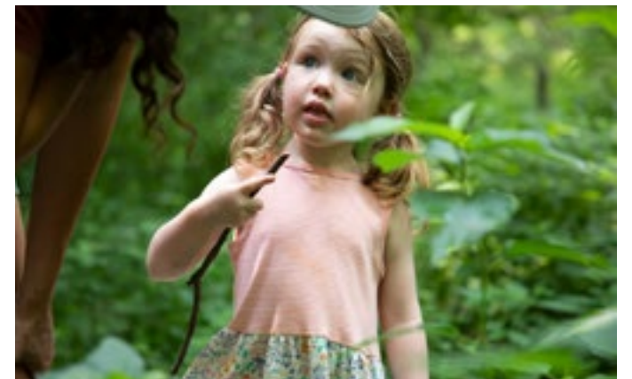
Photos clockwise from top left: A young archer assesses a shot; starting friction fire using a bow drill; two teen participants work together to string a bow during Coyote Howl; Ithaca Forest Preschool participant in the woods; building a fire; teen participants with face painting in Coyote Howl (Photos by Amy Milner and Joe Minissale).