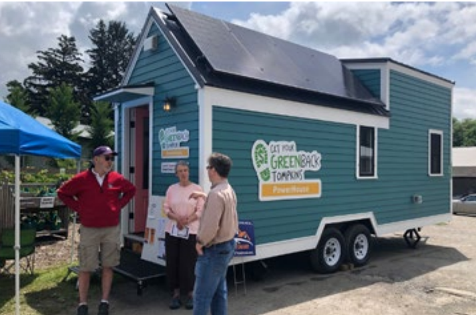
The PowerHouse was open for visits at the Dryden Agway.

In May and June of 2021, Get Your GreenBack Tompkins partnered with volunteer committees and HeatSmart Tompkins to bring the PowerHouse tiny home to Newfield, Trumansburg, and Dryden to support their NYSERDA Clean Energy Communities