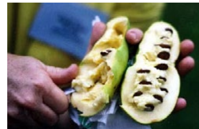
Photos clockwise from top left: pawpaws on tree; Anya Osatuke with tour participants as they enter the orchard, note pawpaw trees at right; Mila Fournier slices fresh pawpaws for tasting after the tour; Cut pawpaw showing fruit and seeds; Mila Fournier (left) and tour participant with pawpaw samples; Anya Osatuke answers questions from pawpaw tour participants.