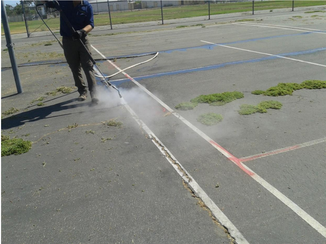
Steam weeder.

Where flammable materials are present, steam or hot foam weeding are preferred over flame weeding. The effect is similar to that of flaming. Commercial equipment is available that use pressurized steam (e.g. WeedTechnics™ ) or hot water + foaming agent (e.g. FoamStream, Weedingtech™ ). These machines remove the hazard of fire but do use about 60 gal of water per hour of use. Also, the output from these devices is HOT and accidental contact with the foam or steam can cause severe burns.