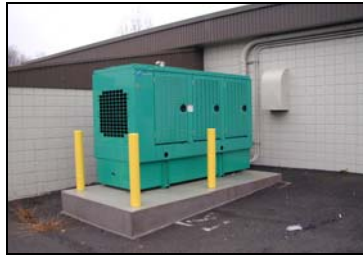
Large Permanent Generator Located Outside

plumbed to the outside and a wall fan is usually installed to provide extra ventilation.