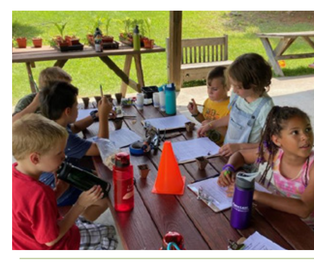
A Farm to School activity held at the Enfield Community Council.

As a team we are motivated to provide support to anyone facing challenges related to the social determinants of health.