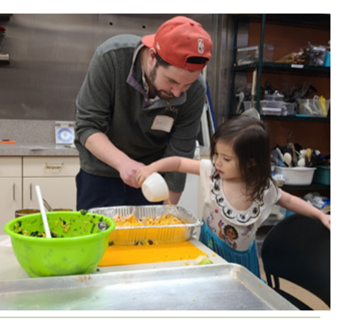
Families learn to make healthy, budget-friendly food together in our programs.

We continued to provide back-end support and evaluation to the Produce Prescription Program , which is now run regionally through Rural Health Network. Over 350 participants were enrolled in a four-county region through a USDA Gus Schumacher Nutrition Incentive Program (GusNIP) grant, with additional enrollees covered by other funding sources.