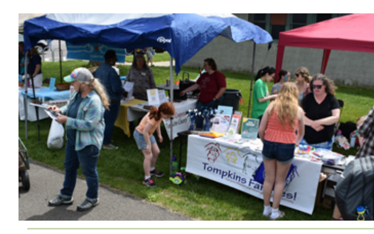
F&CD, Horticulture, & Nutrition at Better Together for Mental Health.

together month after month. Parents who attended had the opportunity to connect and support one another — an unexpected but added benefit!