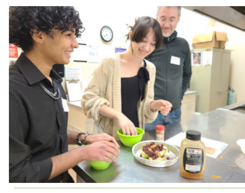
A SNAP-Ed family cooking class in the CCE Tompkins Teaching Kitchen.

The objective of SNAP-Ed Nutrition programming is to improve health and reduce food insecurity and hunger among the SNAP/SNAP-eligible population by providing nutrition education. Our nutritionists lead workshops, food demonstrations, cooking classes, grocery store tours, and community events. In 2023, our nutritionist reached 755 participants through direct education.