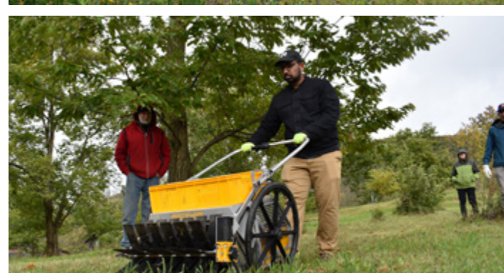
From top: A community tour of Shelterbelt Farm; volunteers learn to take soil samples for the Payment for Ecosystem Services program; a chestnut harvester demonstration.

The pilot centers the experiences of BIPOC (Black, Indigenous, People of Color) and beginning farmers in co-design and co-development through conversations around programmatic elements. The Finger Lakes PES Work Team is the advisory committee for the program with 50+ members bringing community perspectives and technical expertise. Thirteen volunteers attended a soil health workshop and training in April before taking field samples on six farms.