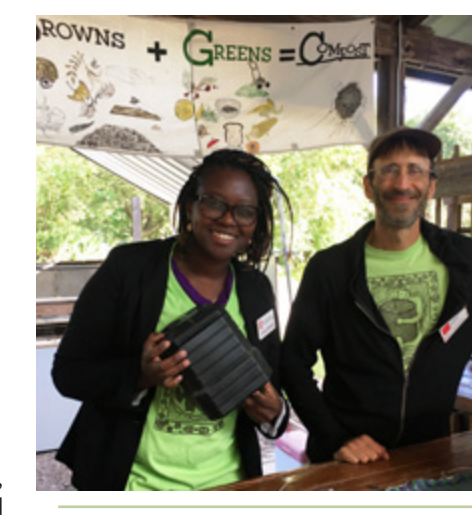
Master Composters at the Ithaca Farmers Market.

The program worked with multi-family groups at Unity House, Commonland Community, the Freeville Community Garden, and more to start or improve composting. Support and encouragement via the telephone and online "Rotline" aided about 150 residents, while fact sheets and videos were viewed thousands of times.